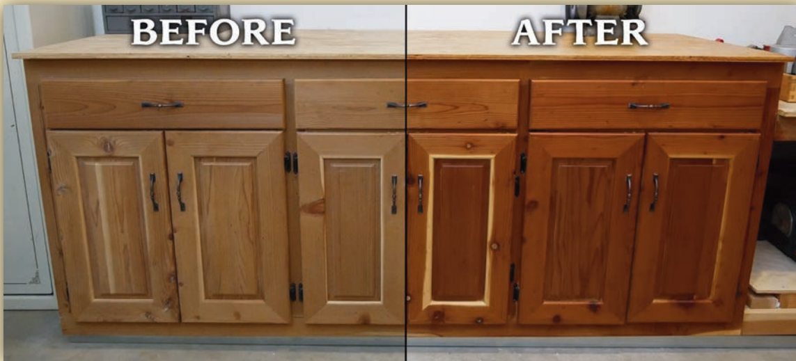
Perfect for dry and faded wood finishes on cabinets, furniture, and more!

Over time, wood furniture, cabinets, and especially antiques, tend to “dry out” and fade. Feed-N-Wax helps introduce conditioning oils that “feed” the wood, while leaving behind a protective coating of beeswax and Brazilian carnauba wax to polish and shine. Feed-N-Wax may be used whenever the wood or wood finish looks faded or dry.