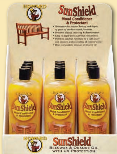
Counter Display Item #CDSS