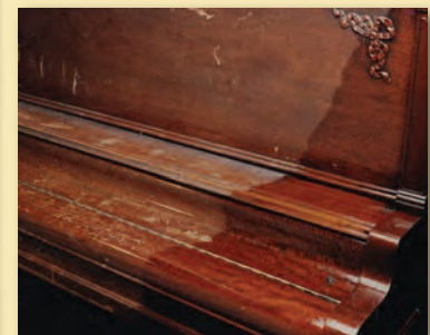
Restores original finish