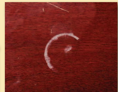
Removes white heat rings